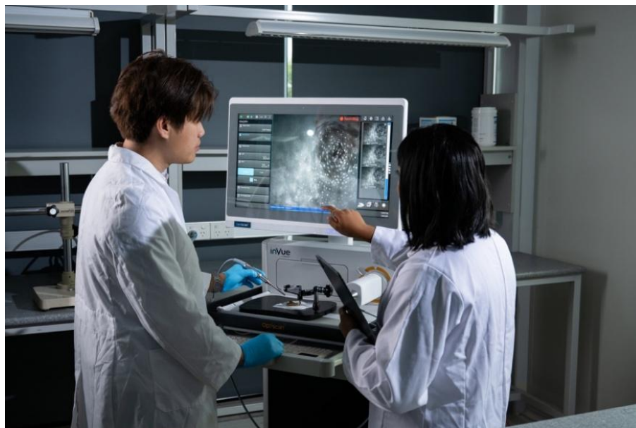
Figure 1: Optiscan's InVue® intraoperative surgical device